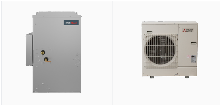
INDOOR Unit ... PAA-AA24NL OUTDOOR Unit ... PUY-AH24NL