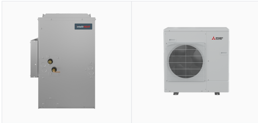
INDOOR Unit ... PAA-BA30NL OUTDOOR Unit ... PUZ-AH30NL