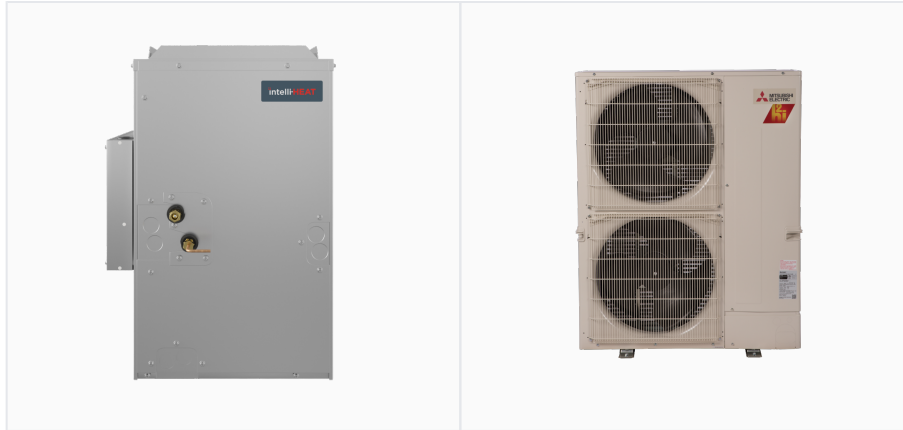
INDOOR Unit ... PAA-AA30NL OUTDOOR Unit ... SUZ-AK30NLHZ