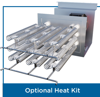
Optional Heat Kit